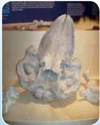
Pilot whale skull

The Pentland Firth is one of the world's wildest stretches of water. Two tides a day surge through its 27km length from the Atlantic to the North Sea and back. Reefs, island, headlands, wind and tide create whirlpools and walls of water. These sweeping tides carry food for thousands of different marine organisms, from tiny shrimps to killer whales.