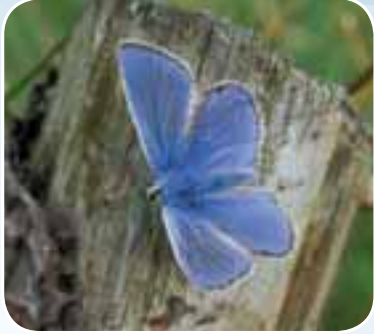
Common Blue butterfly

Seadrift introduces you to life around Dunnet Bay and beyond, season by season. Plan time to visit standing stones, Iron Age brochs and crofting villages. Puffins, terns, butterflies, otters, seals etc, and cetaceans (whales, dolphins and porpoises) and wild flowers such as Scottish primrose are just some of the things you can see.